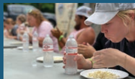
CHEESE CURD EATING CONTEST Saturday 2pm