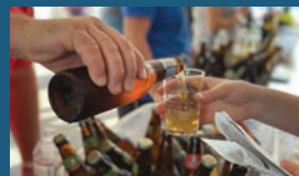
CORKS & KEGS Friday 6:30-7:30pm Saturday 6:30-7:30pm