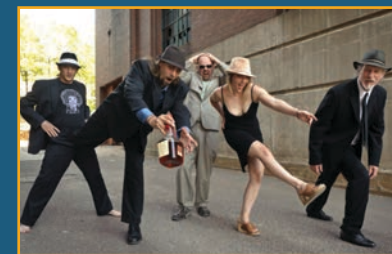
LEFT WING BOURBON 4:30-6:30pm | Saturday, June 24 | Main Stage