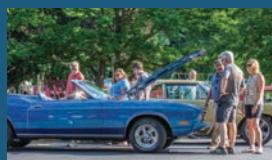
CAR SHOW Friday | 5pm