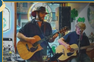
THE OATMEAL BAND 7:30-9:30pm | Friday, June 23 | Point Stage