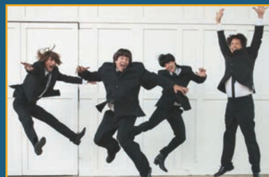
A HARD DAY'S NIGHT BEATLES TRIBUTE BAND 7-9pm | Friday, June 23 | Main Stage