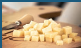
BLOCK PARTY! CHEESE TASTING: Saturday 2-3:30pm