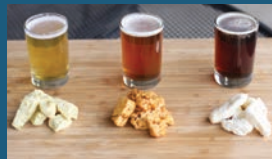
CRAFT & CURD: PAIRED Friday 4-6pm Saturday 4-6pm