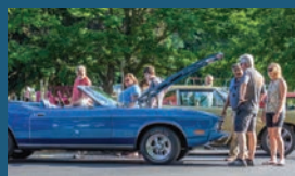
CAR SHOW Friday 5pm

TASTE 30+ CRAFT BEERS | HARD CIDERS | LOCAL WINES