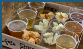
CRAFT & CURD: PAIRED Friday 5-6:30pm Saturday 5-6:30pm

Ellsworth's Cheese Curd Festival celebrates our town's designation as the 'Cheese Curd Capital' of Wisconsin. From the creative cheese curd foods and the famous Cheese Curd Eating Contest, to artisan vendors and live music... the Cheese Curd Festival offers great fun for everyone!