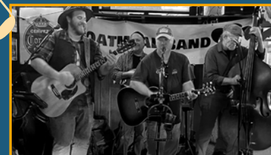
OATMEAL BAND 11-12:30pm | Saturday, June 28 | Park Stage