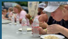
CHEESE CURD EATING CONTEST Saturday 2pm