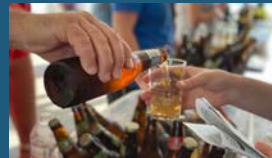
CORKS & KEGS Friday 7-8pm Saturday 3-4pm & 7-8pm