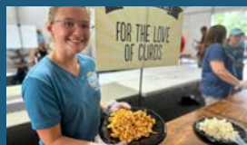
BLOCK PARTY! CHEESE TASTING: Saturday 1:30-2:30pm