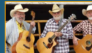
THE DAIRY AIRES 12-1:30pm | Saturday, June 28 | Point Stage