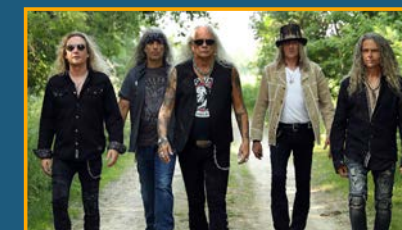
THEM PESKY KIDS

4:30-6:00pm | Saturday, June 27 | Park Stage