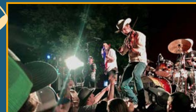
GUS SENT ME

4:30-6:30pm | Friday, June 26 | Park Stage