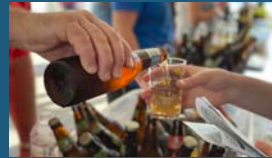
CORKS & KEGS Friday 7-8pm Saturday 3-4pm & 7-8pm