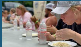
CHEESE CURD EATING CONTEST Saturday 2pm