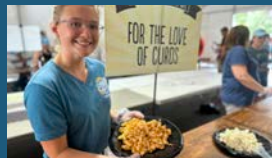
BLOCK PARTY! CHEESE TASTING: Saturday 1:30-2:30pm