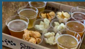
CRAFT & CURD: PAIRED Friday 5-6:30pm Saturday 5-6:30pm

Ellsworth's Cheese Curd Festival celebrates our town's designation as the 'Cheese Curd Capital' of Wisconsin. From the creative cheese curd foods and the famous Cheese Curd Eating Contest, to artisan vendors and live music... the Cheese Curd Festival offers great fun for everyone!