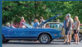
CAR SHOW Friday 5pm

TASTE 30+ CRAFT BEERS | HARD CIDERS | LOCAL WINES